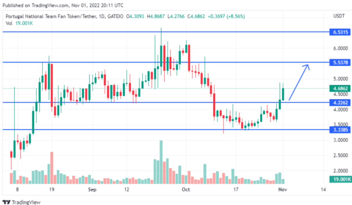
POR Price Chart

At present, one Portugal National Team Fan Token is worth $4.69, and $6 million has changed hands in the last 24 hours. The price of the Portugal National Team Fan Token has risen by more than 8% in the past 24 hours and more than 22% in the past 7 days. A current market cap of $14 million places CoinMarketCap at position #654 on CoinMarketCap. There are a total of 3,180,799 POR coins in circulation.