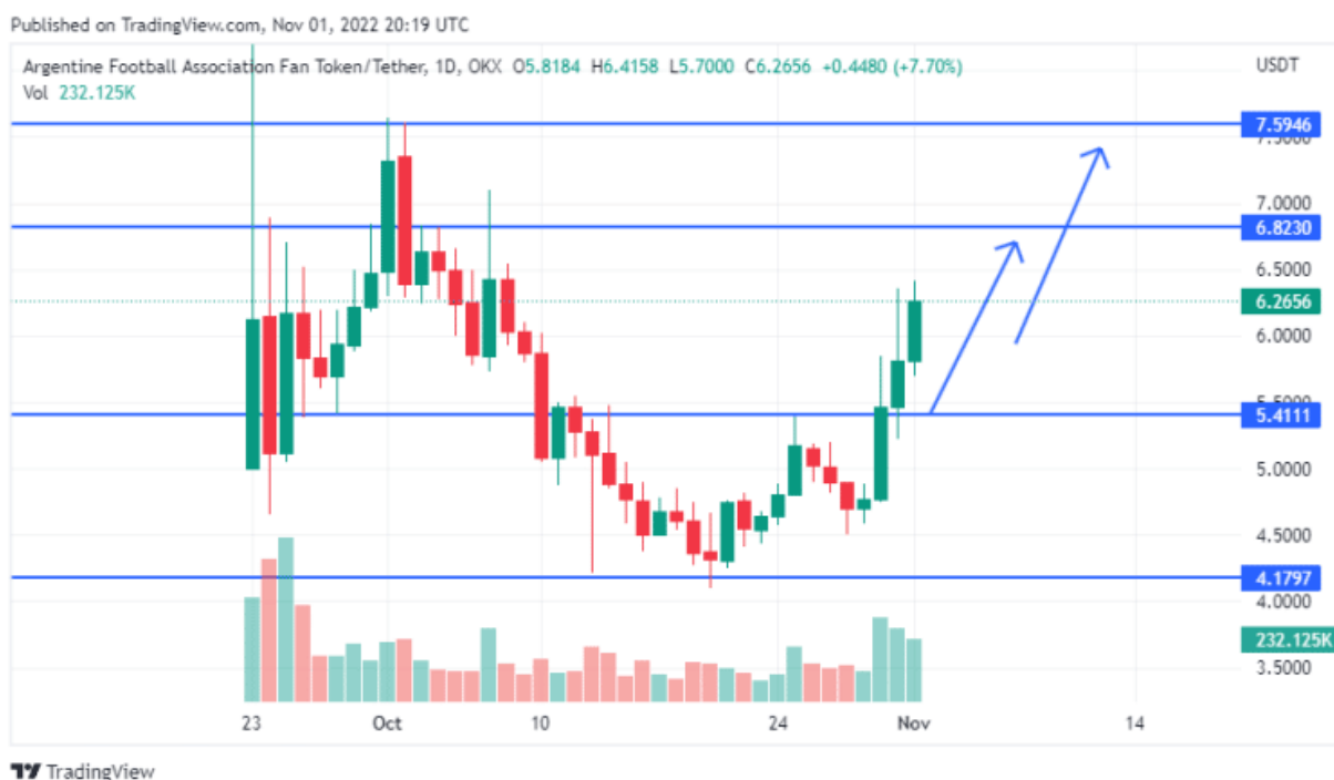
ARG Price Chart

Trading in ARG/USDT is strongly positive after the pair bounced off the $4.15 support level. The previous barrier of $5.40 is now being used as support after being breached. ARG could rise to $6.80 or $7.60 if the current bullish trend continues.