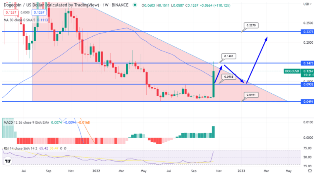
Dogeecoin Price Chart

Technically speaking, the $0.14 level, which is being stretched by a bearish trendline, continues to act as resistance for Dogecoin.