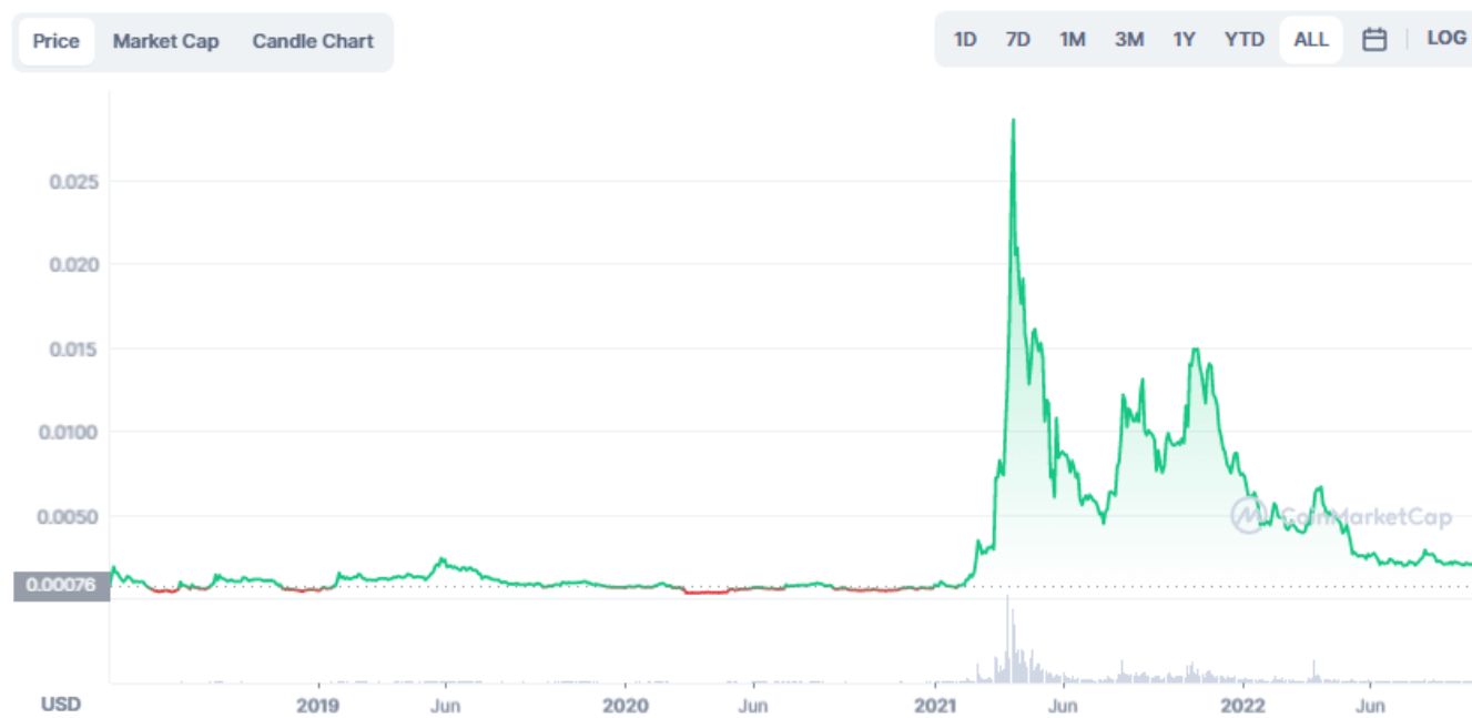
Holo to USD Chart

That development resulted in massive demand for the HOT token, surging it to its all-time high (ATH) of $0.028 in April 2021. The Holo token proved that it can provide investors with significant returns in just a few weeks. A massive crash followed, and Holochain's coin plummeted to $0.005 by July 2021.