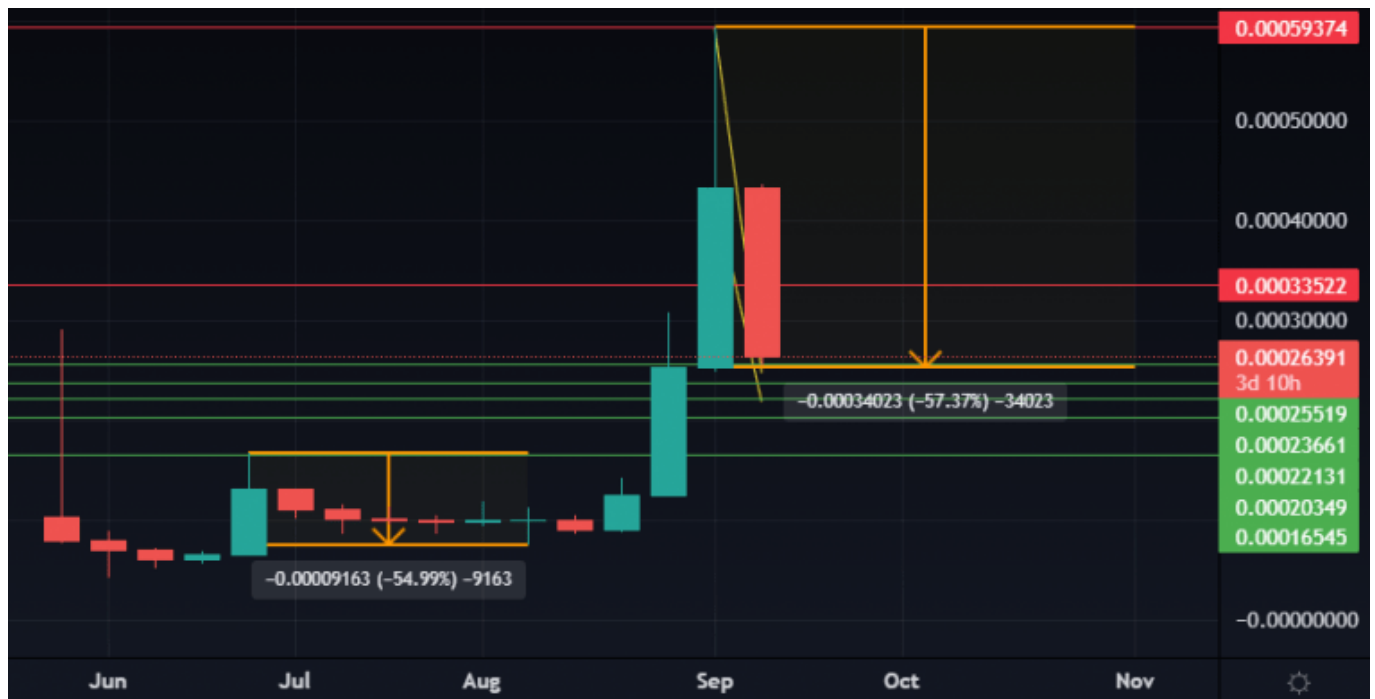
LUNC/BUSD - Weekly Time Frame

This reflects that whilst it is extremely bearish, it could be considered normal price action for Terra Luna Classic, especially considering the volatility and bearish sentiment of the market at present.