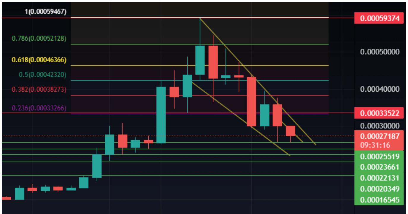
LUNC/BUSD - Daily Time Frame

Ever since Terra Luna Classic (LUNC) slipped away from the euphoric high of $0.000593 the price has followed a textbook falling wedge pattern. If LUNC can break out through the resistance trendline there is a good chance of retesting the 0.236 Fibonacci extension level which would result in a 25.31% increase in price from current levels.